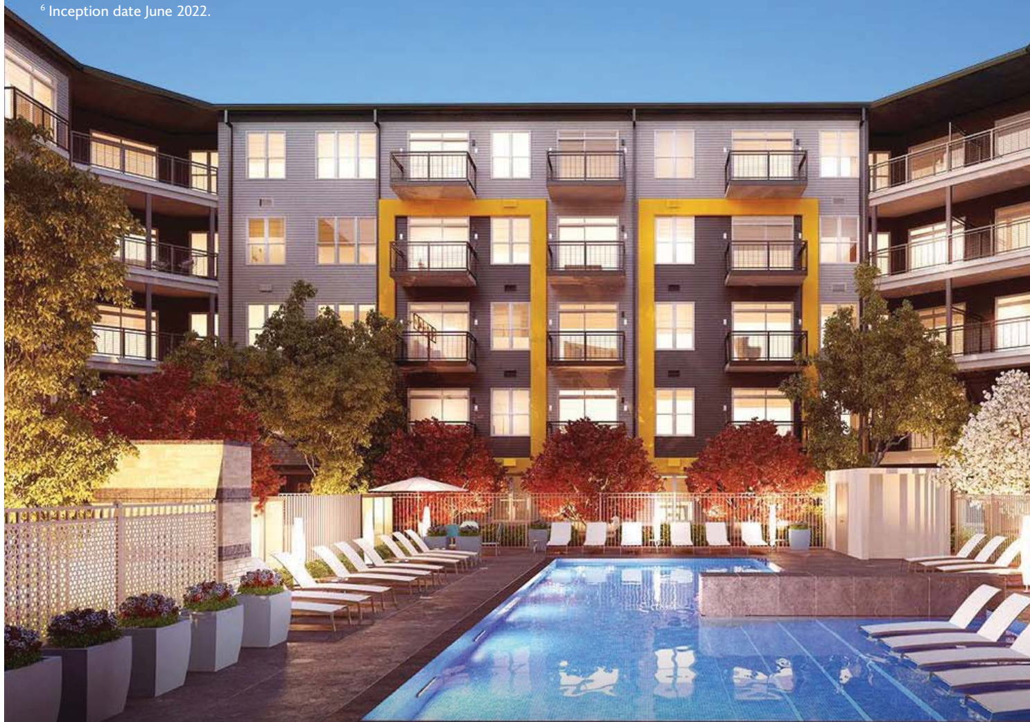
THE PARKER AT HUNTINGTON METRO