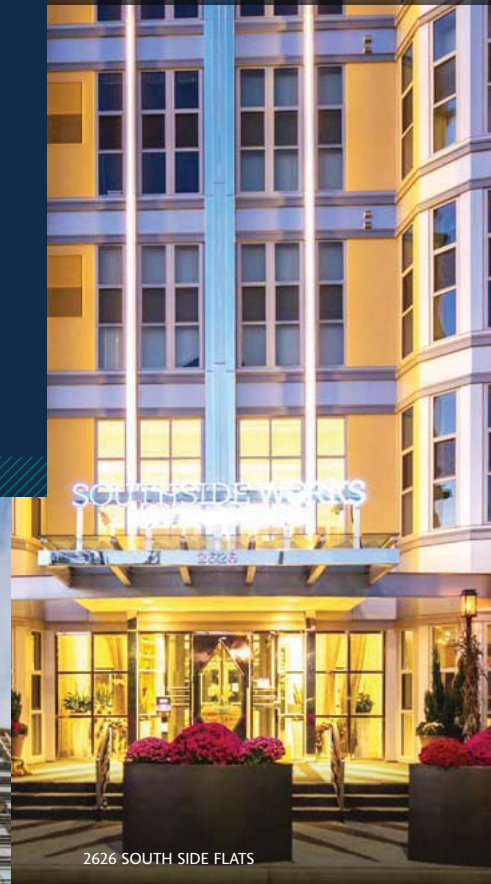
2626 SOUTH SIDE FLATS