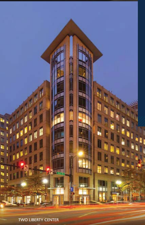
TWO LIBERTY CENTER