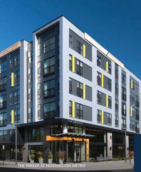
THE PARKER AT HUNTINGTON METRO