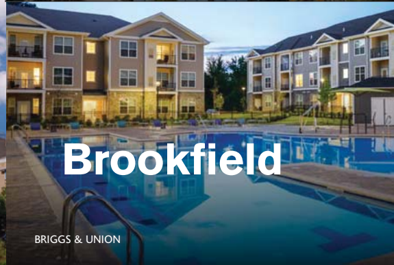
BRIGGS & UNION