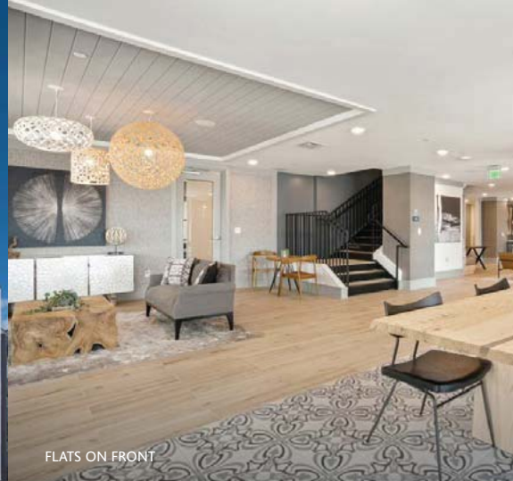
FLATS ON FRONT